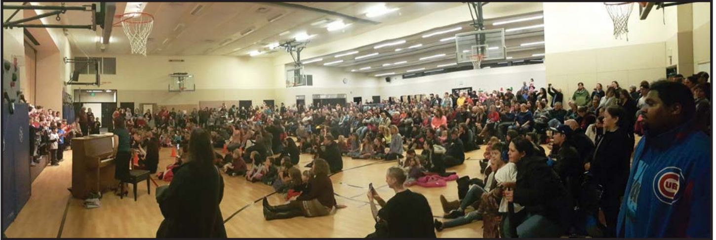
A full house for Garfield's K-3 Winter Concert.