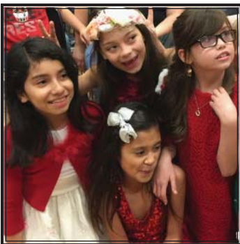
Cheetahs taking a moment together