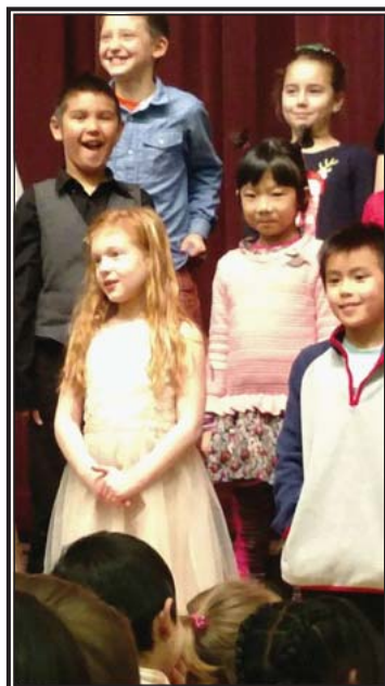
Second graders perform