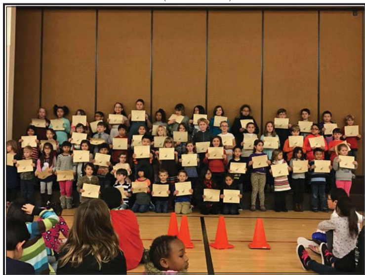
LifeSkills Award winners